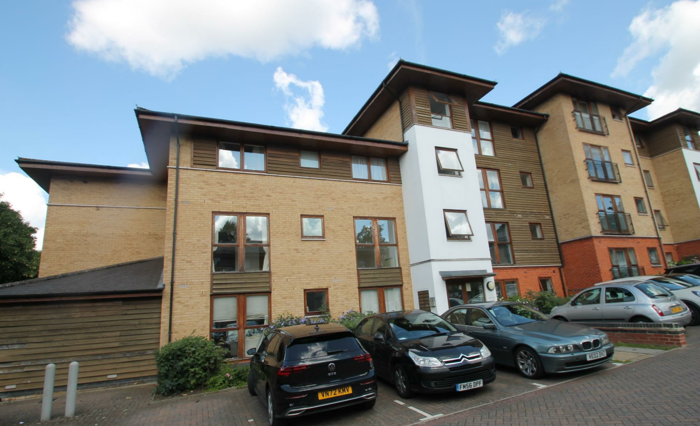
45 Sapphire House Coral Park, Maidstone, Kent, ME14 5HQ Price £160,000